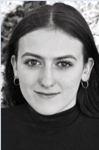
(professional dancer, Wales)