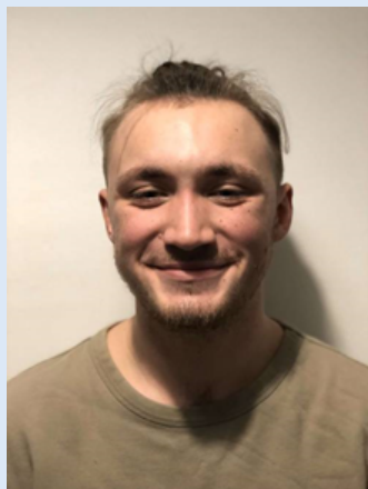
(student dancer, England)