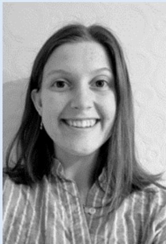
(student dancer, England)