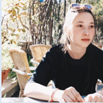
(student dancer, Belgium)